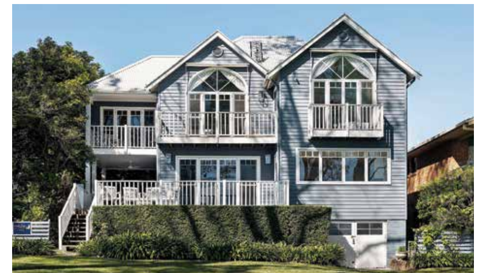
Clockwise from the top: antique French oak flooring connects the different spaces; Melanie's work space has plenty of natural light; the Hamptons style main home.

As with most waterfront properties, the home is positioned close to the water creating garden space between the roadside entrance and the residence and allowing for perfect separation between the professional and private spaces. The 36m 2 cottage with two rooms and