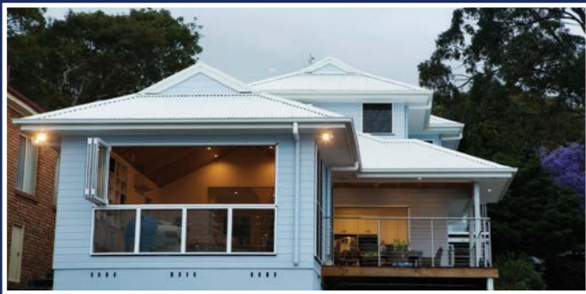
Multi-Award Winning Accredited Building Designer